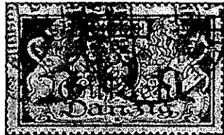
Danzig Mi #192 Lot 37

Sunday, June 3, 2007 – 1:00 pm Sherman Amphitheater – Lower Lobby Level