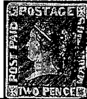
Mauritius #14B Lot 379