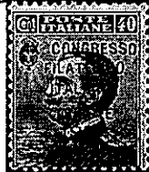
Italy #142 A-D Lot x152