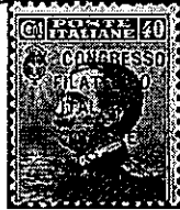
Italy #142 A-D Lot x152